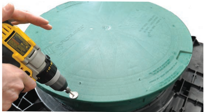
Prior to backfilling, fasten the lid to the riser with screws provided.

Use the ten #14 x 2" stainless steel lid screws with washers provided with the tank to fasten the lid to the riser. There are nine hexagonal head stainless steel bolts and one #3 pan-head Robertson screw, which is used as a tamper-resistant fastener. Depending upon which end of a riser segment is being used for the lid connection, use the outer-diameter screw pilot holes on the lid for the larger-diameter end of the riser and the inner-diameter screw holes for the smaller-diameter end of the riser. Call-outs on the lids clearly define the proper screw pilot holes to use for the different bolt patterns. Adjust the screw gun settings to prevent stripping-out the pilot holes. Do not