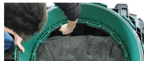
Engage one set of tabs into proper position.

application of a sealant or mastic on the connection surface is not required. Proper care must be taken to ensure the gasket surface is clean and free of debris. It is recommended that all gaskets and connection surfaces be wiped clean. Each riser section is tapered to have a narrow end and a wide end. When shipped, the EZsnap Risers are stacked wide end down and nested together. When making riser connections, the narrow ends are designed to connect to the narrow end and the wide end is designed to connect to the wide end. It is a recommended best practice that the taller sections be installed at the deepest points of the installation.