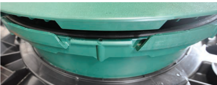
Set lid on uppermost riser segment and rotate to receiving pocket on riser.

The EZsnap Lid will accommodate both the narrow and the wide end of the riser. To install, set the lid on top of the uppermost riser segment and rotate until the riser tabs recess into the receiving pockets on the lid. The lid will drop downward approximately 1/2" (13 mm) and stop rotating when seated properly. With the lid properly seated, the screw pilot holes are in alignment.