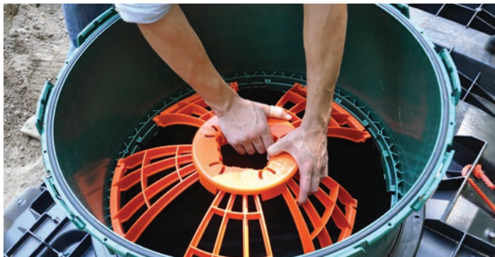
Infiltrator's five arm Safety Star system is equipped with a folding arm for easy installation.