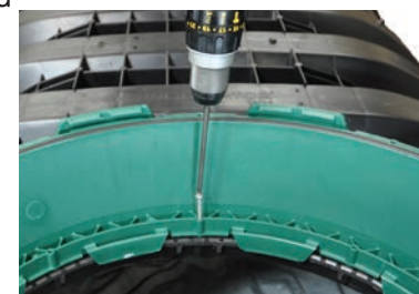
Screws required for riser to tank connection only.