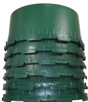
Risers nest together for efficient shipping.