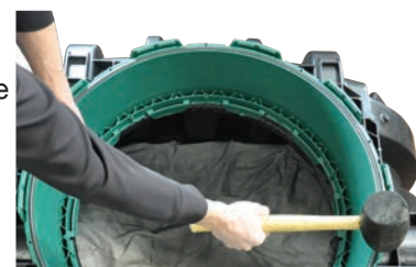
Use mallet to engage the rest of the tabs.